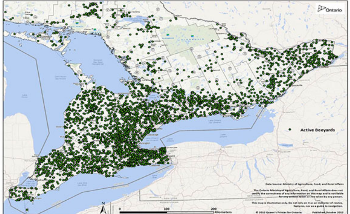
Location of Bee Yards, 2013