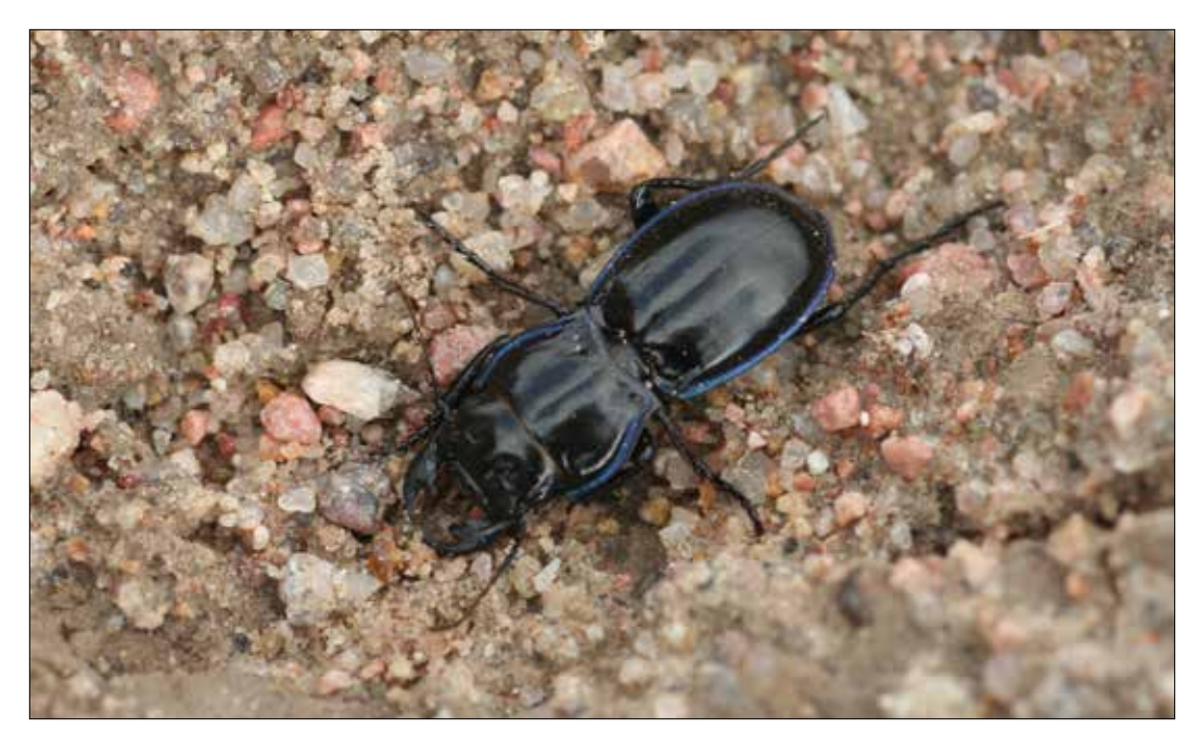
Ground beetles such as this blue-margined ground beetle ( Pasimachus elongatus ) are predators as both adults (shown) and larvae. They may be exposed to neonicotinoids directly when applied as a soil drench and indirectly via contaminated food items.

larvae of predatory ground beetles and rove beetles (Kunkel et al. 1999).