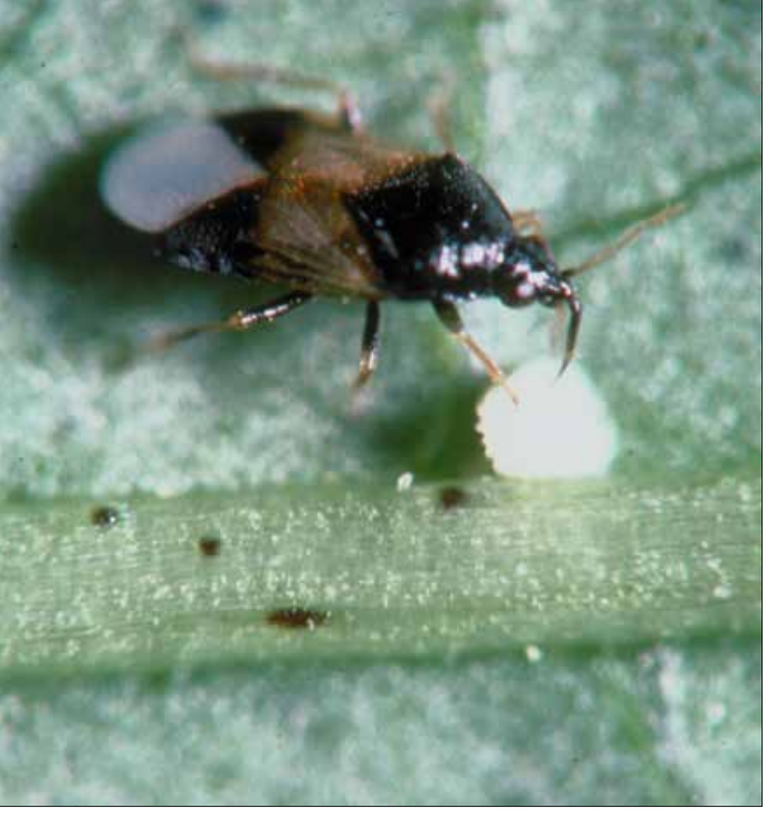
Aptly named, the minute pirate bug ( Orius insidiosus) is a tiny but voracious predator. Pirate bugs can consume around 30 small insects or eggs per day, and excel at seeking out prey at low densities