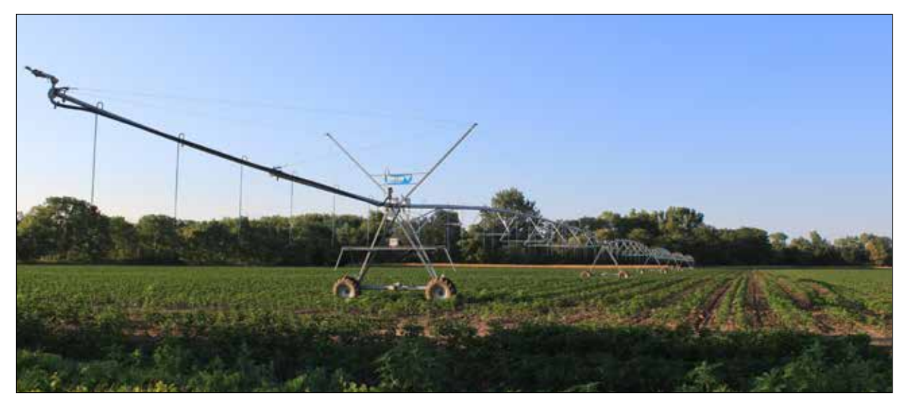
The economic benefits from neonicotinoid treatment of crops are mixed. Studies of soybean and corn crops demonstrate limited or inconsistent yield protection, and the cost of treatment wasn't always covered by the increased yield.

of corn can increase yields but when pest pressure is reduced, there are no consistent effects of seed treatment on yield (Wilde et al. 2007). Similarly, in winter wheat, economic returns from imidacloprid seed treatments were consistent with high aphid and virus pressure, but in crops with reduced virus and aphid pressures, the cost of the insecticide exceeded the yield benefits in crops (Royer et al. 2005).