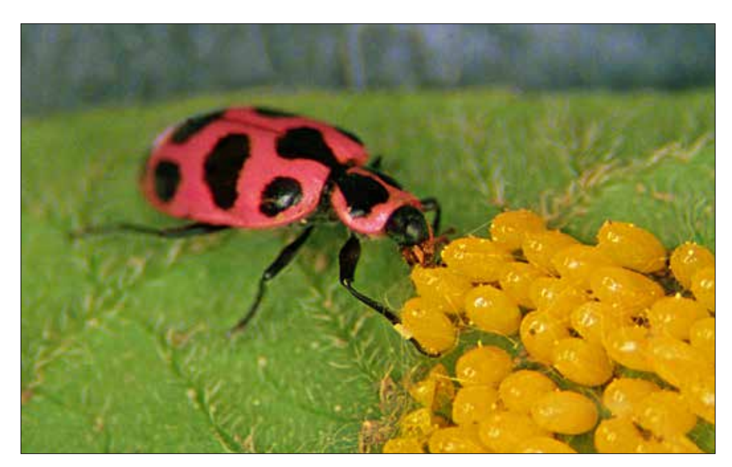
Neonicotinoids, intended to kill plant-damaging pests, have indirect impacts on beneficial predatory insects. Spotted lady beetle ( Coleomegilla maculata ) eating eggs of Colorado potato beetle.