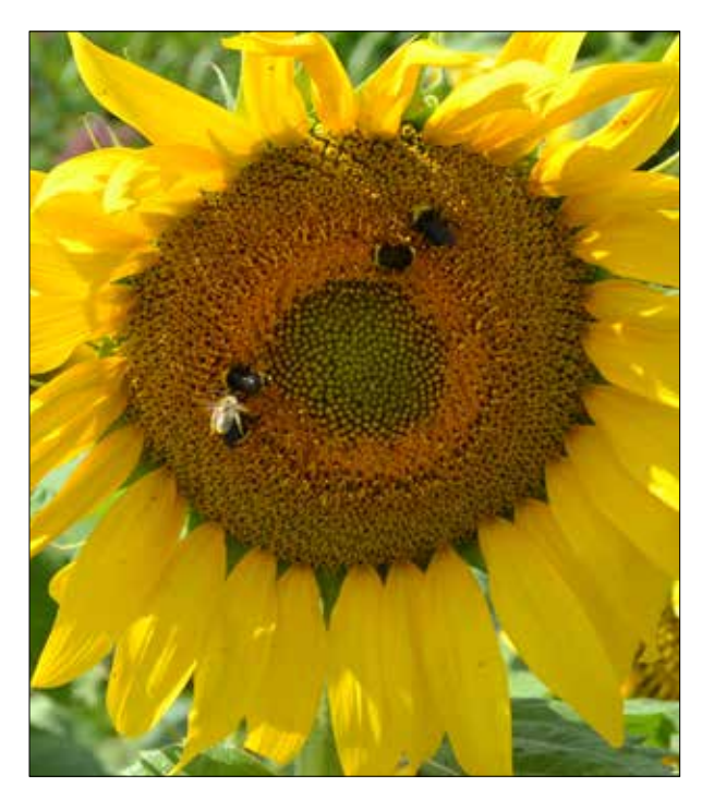
The threat from neonicotinoid residues to bumble bees and other flower-visiting insects is well known. The risk to beneficial predators and parasitoids of plant pests has generally been overlooked.

As use of neonicotinoids becomes increasingly widespread, it becomes more and more vital to understand their impacts on nontarget wildlife and consequently, ecosystem health. Much concern has been focused on the effects of neonicotinoids on bees. Bees and other pollinators are exposed to neonicotinoids in several ways, including insecticide-contaminated dust and residues in pollen and nectar. Although the balance of evidence from published research suggests that exposure through pollen and nectar rarely causes direct mortality, there is