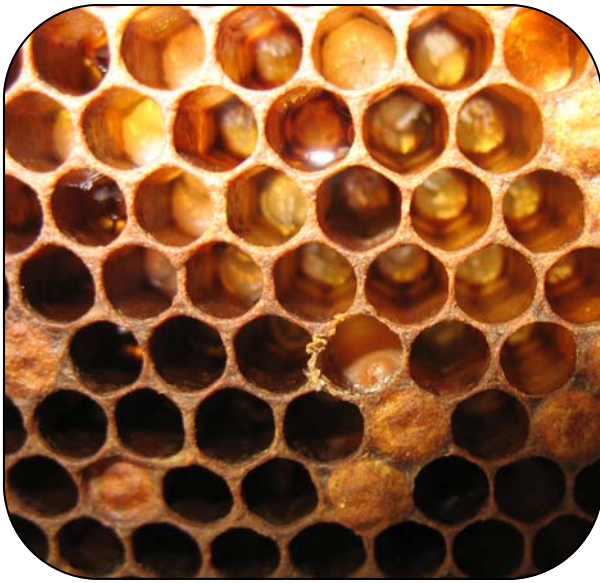
Figure 6. Infected larvae settled to the bottom of the brood cell.