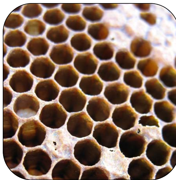
Figure 5. Sunken perforated cell cuppings.