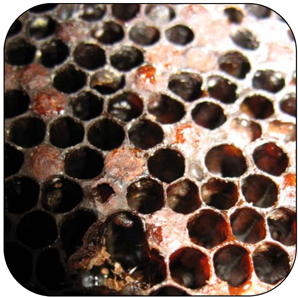
Figure 8. Note rotted, drying AFB scale and greasy, dark wax comb.

This is specific to AFB. After the diseased larvae settles to the bottom of the cell it will begin to dry and harden. This is an important symptom found in used brood comb. The best way to do this is to hold each frame with your