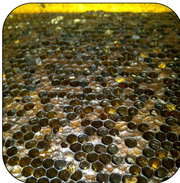
Figure 4. Spotty brood pattern with noticeable AFB scale.

Honey bees from one colony may collect the honey stores of another colony. When this occurs, AFB spores can be transferred with the honey. This can result in the spread of AFB within a beeyard or between different beeyards (up to 8 km). This is particularly a concern during a nectar dearth when combined with weakened colonies and exposed contaminated wax comb. Infected beekeeping equipment that is stored in locations accessible to honey bees is another source of infection.