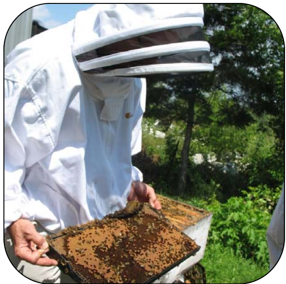
Figure 9. Inspection of a brood frame.