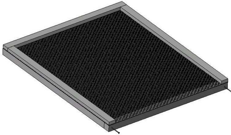
Figure 2 - Screened bottom board with nails in the ends of the \frac{7}{8} " parts