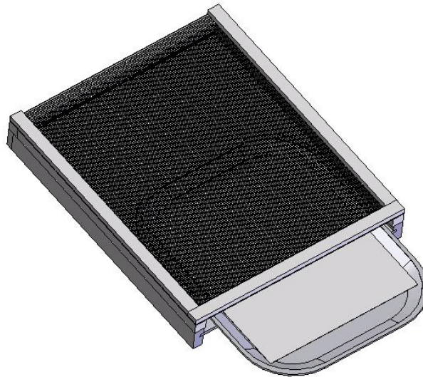
Figure 3 - Sticky board positioned on a tray below the screened bottom board